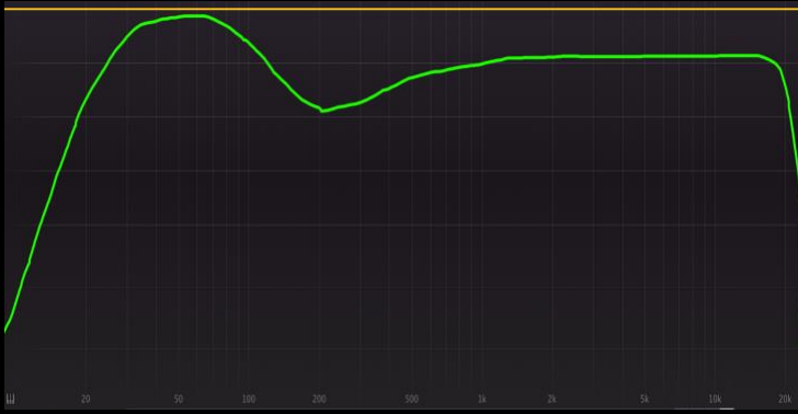
Figure 4 Ideal curve

1.2: Ideal Curve: Your spectrum should approx. look as following: