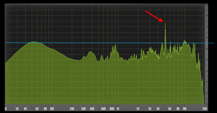
Figure 5 Peak that is too loud

2. Labelling: Number, Artist, Title, "Final Mix"